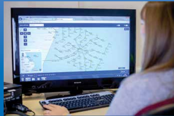
Desktop GIS in use

Our intelligent marine and coastal mapping data are designed to be compatible with all leading desktop and web-based Geographical Information Systems (GIS).