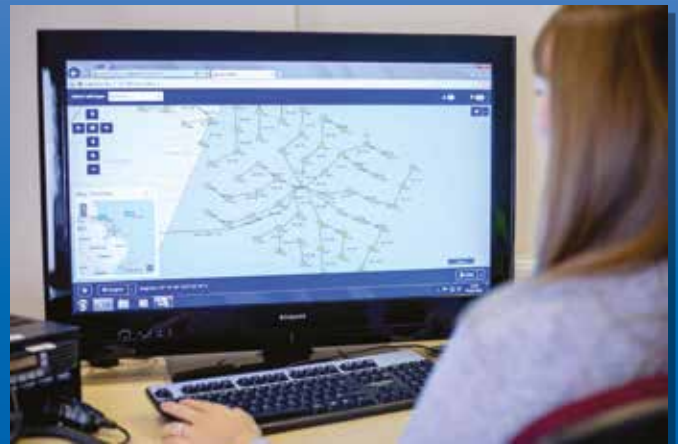
Desktop GIS in use

Our intelligent marine and coastal mapping data are designed to be compatible with all leading desktop and web-based Geographical Information Systems (GIS).