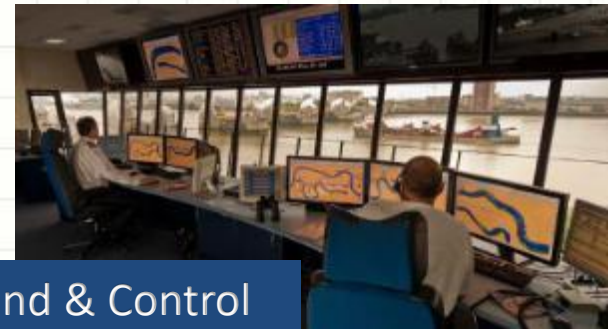
Command & Control