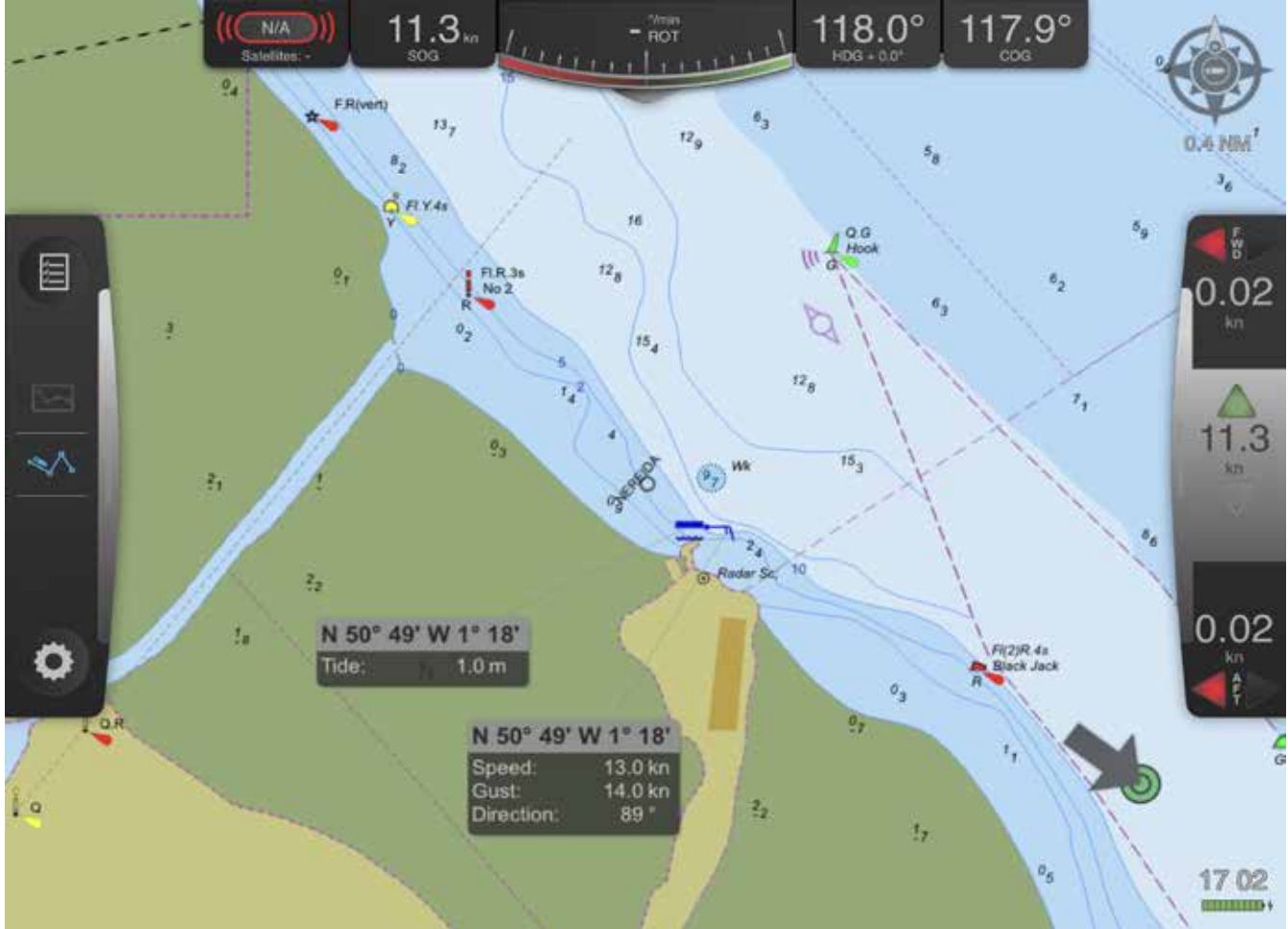
Screen shot example from a Trelleborg 'Safe Pilot' Portable Pilot Unit showing how maritime pilots use data including water depths, vessel tracks, weather and tide information.

Over the last 20-year period, a steadily growing number of HO's have supported the release of exchange datasets in S-57 format under a re-use licence, or in some cases, source datasets under a similar arrangement or open licence. However, this is not the case everywhere and, in many areas, navigational products are still being used for non-navigational purposes because there is a lack of viable and legitimate alternatives. The practice of digitizing or scanning and geocoding paper charts prevalent in the 1980s and 1990s still goes on but has been supplemented by similar misuse of their electronic equivalents.