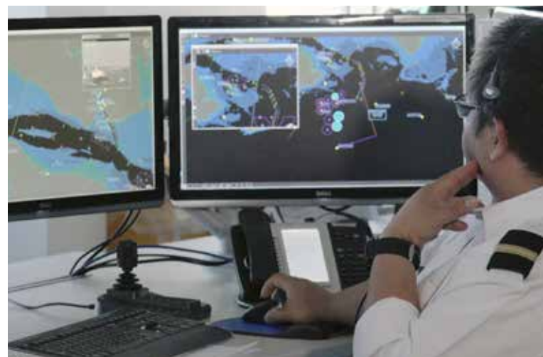
Electronic mapping at a U.K. port monitoring vessel traffic

into the IHO's constitution, and more recently to deliver the IHO's objective that hydrography is 'not just for charting', the MSDI Working Group is now at the heart of how a modern HO views and manages its data more generally.