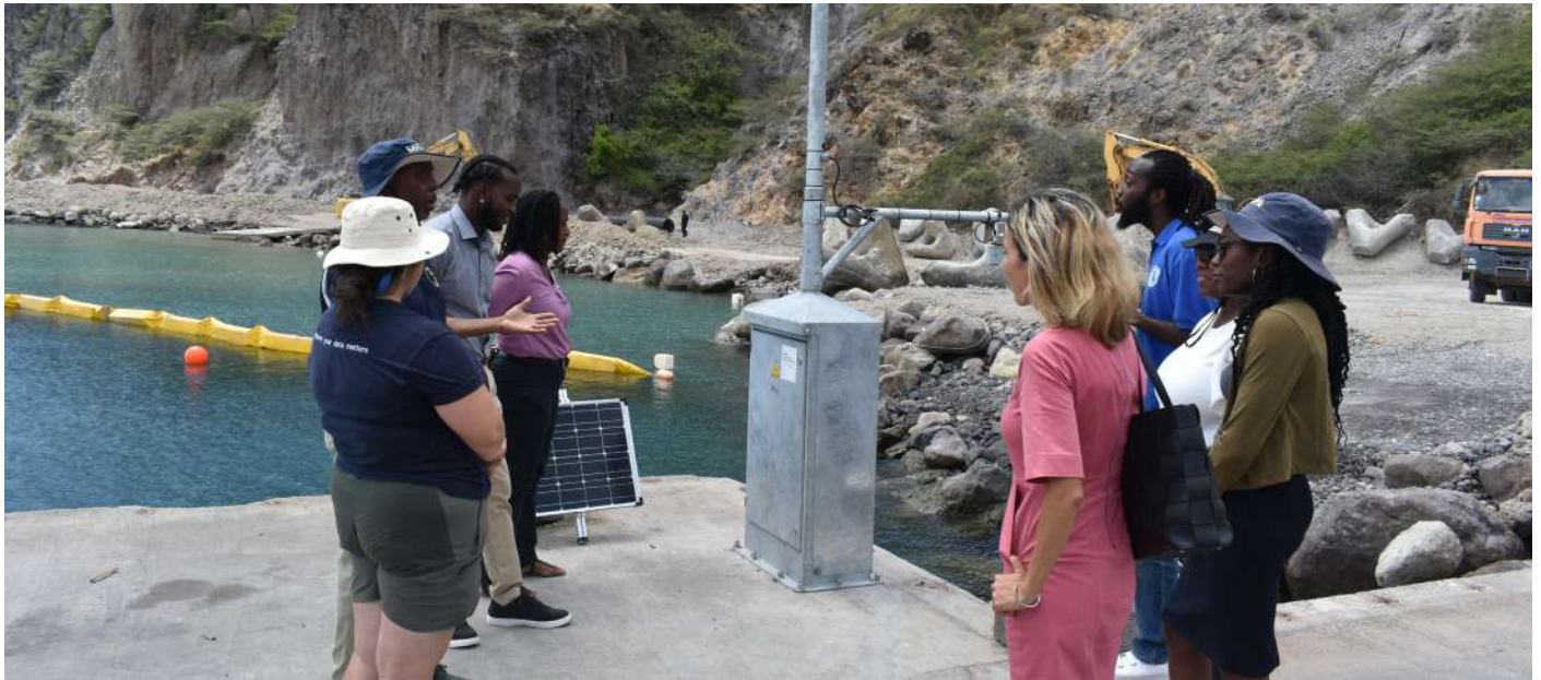
Fig. 5 Onsite training for Montserrat Port Authority provided by OceanWise in the functionality of the MEMS and the importance of proactive maintenance to ensure continuity in reliable data.

the asset lifespan. Of great importance when trying to optimize and stretch out limited budgets!