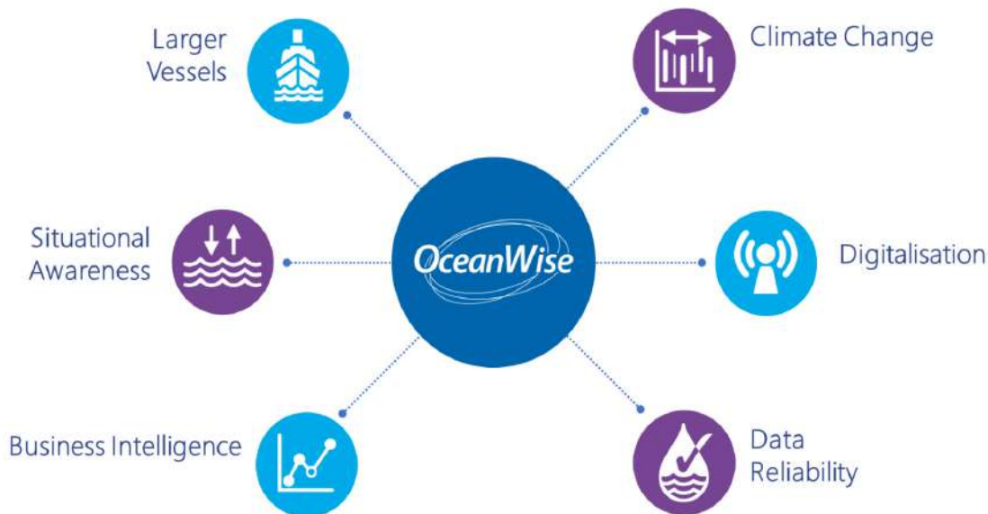
Fig. 1 The importance of environmental monitoring within the marine industry.

Commission's (IOC) Sea Level Station Monitoring Facility, whilst also assisting in refining tidal modelling and predictions. Additionally, all data collected is automatically analysed, processed and archived in a centralized and dedicated online server. Data is made available for the purposes of maritime and navigational safety, planning and situational awareness including assisting with ongoing programmes to update charts and associated navigational publications, and for Tsunami warnings as required.