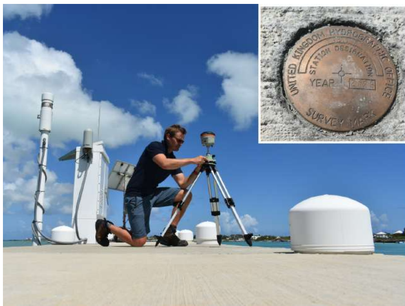
Fig. 3 GNSS leveling at Sapodilla Bay, Turks and Caicos Islands to establish geodetic benchmarks for tide gauge levelling and establishing a local datum.

in data validity. The indicators operate using a simple colour coded warning system which helps to give the user confidence (or not) in the data and to treat it accordingly. Alerts are also displayed and the user can click through to view the received error message to assist with fault finding and resolution.